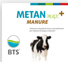
FOR MANURE BIOGAS PLANTS Specific mixture for plants fed with high percentages of manure (pig, bovine)