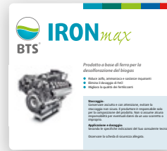
IRON MAX Iron chloride