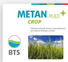
FOR SILAGE BIOGAS PLANTS Specific mixture for plants fed with high percentages of silage