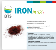
IRON MAX3 Iron hydroxide