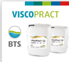
VISCOPRACT Product adapted to emergency cases with floating layers