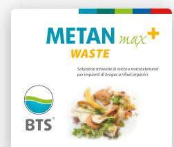
FOR ORGANIC WASTE BIOGAS PLANTS Specific mixture for plants fed with high percentages of organic waste