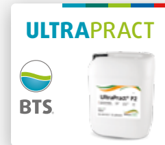
ULTRAPRACT An enzymatic product especially for use with high-protein rations