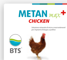
FOR POULTRY MANURE BIOGAS PLANTS Specific mixture for plants fed with high percentages of hen/boiler manure