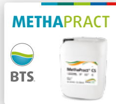
METHAPRACT An enzymatic product for maintenance